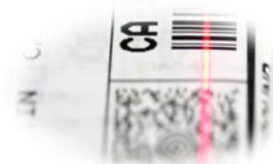
Display & Packaging Services