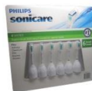
Cosmetics & Personal Care