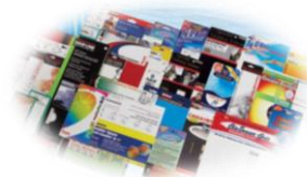
Printed - Blister Cards & Cartons