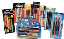
School & Office Supplies