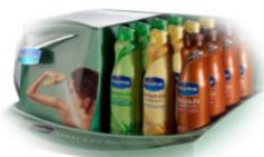
POP Display & Packaging