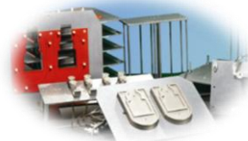
Blister & Seal Tooling